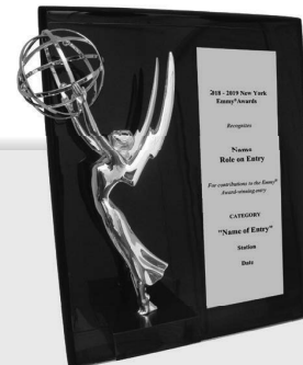
Contributor Plaque with Statuette $350.00