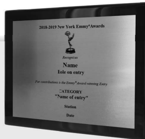
Rosewood Contributor Plaque $150.00

Orders are subject to review and approval. 10-1/2" x 13" plaque with engraved plate or personalized life size Emmy statuette.