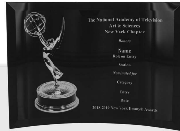
Curved Art Glass $175.00