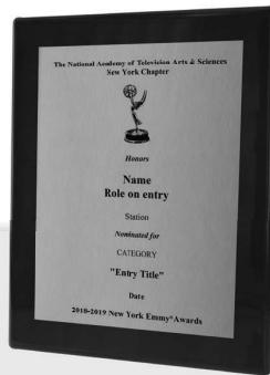
Rosewood Nomination Plaque $125.00

Nominated Entries may order a rosewood plaque (10" x 8") or translucent, curved art glass (10" x 7") personalized with your name and recognizing your work on an Emmy® Nominated work.